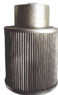
BIG STRAINER - Sc3 200 TO 600