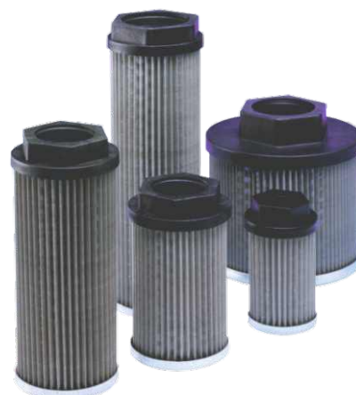
NYLON STRAINER (NSS)