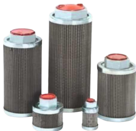
Steel Nut - SC2