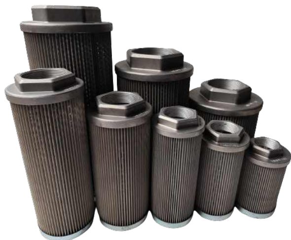
Aluminum Die Cast Nut - STR3